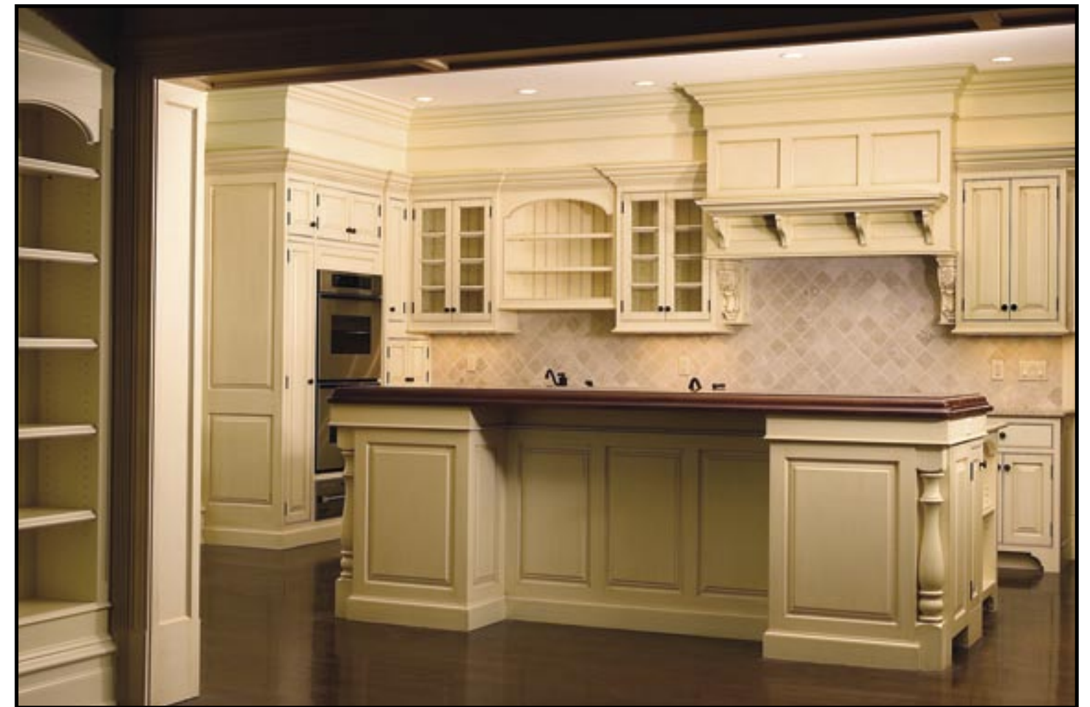
Kitchen, Greenwich, CT, Bloom Design LLC