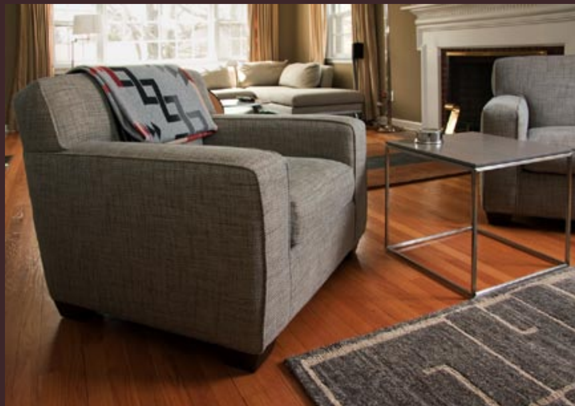
Bench, New Haven, CT, Bloom Design LLC

Budget questions need not be daunting. Budget responds to the project's overall intention and level of detail. The Main Concourse in Grand Central Terminal has its place, as does a mass transit wind and rain shelter on Main Street. When designing a family room, we can settle on a wonderful paint finish, or alternatively on some wonderful silky maple paneling. Defining a budget that is appropriate to the design intent is a necessary opening gambit.