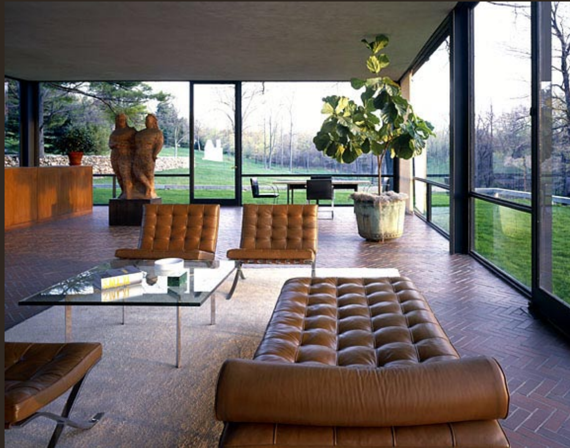
Glass House, Philip Johnson, New Canaan, CT