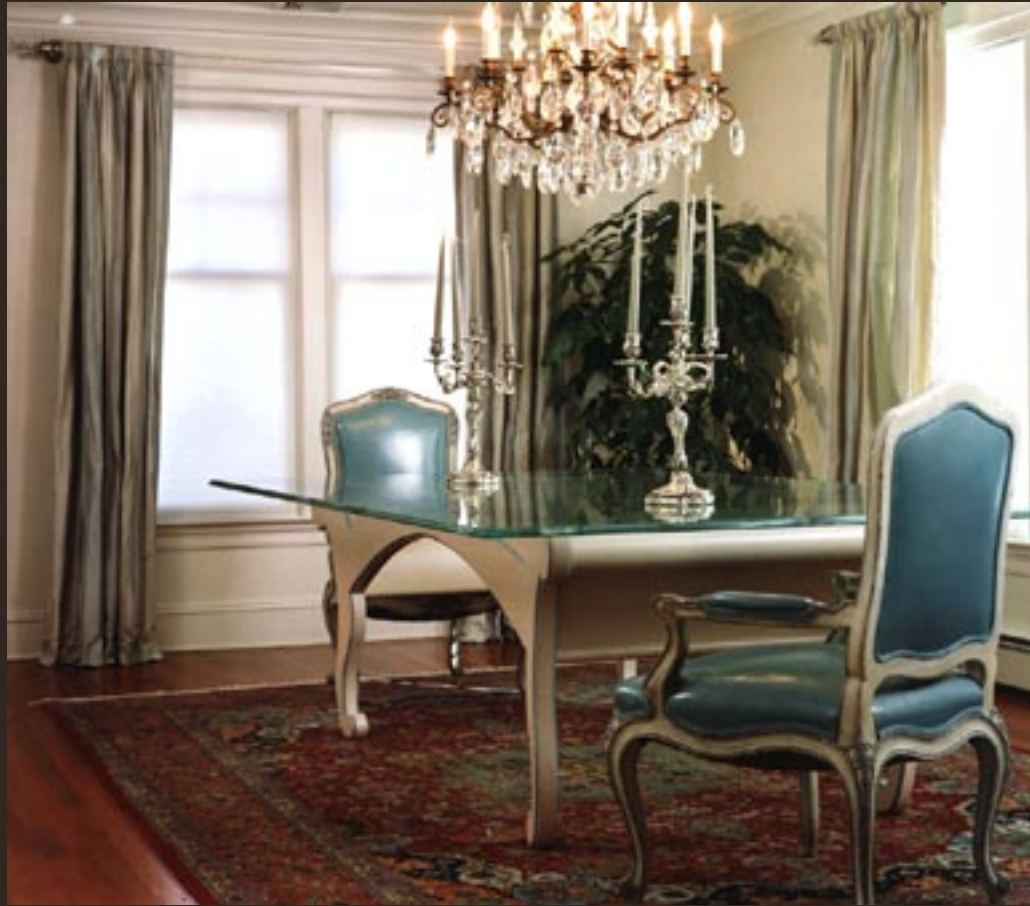
Media Center, Bloom Design LLC, Stamford, CT