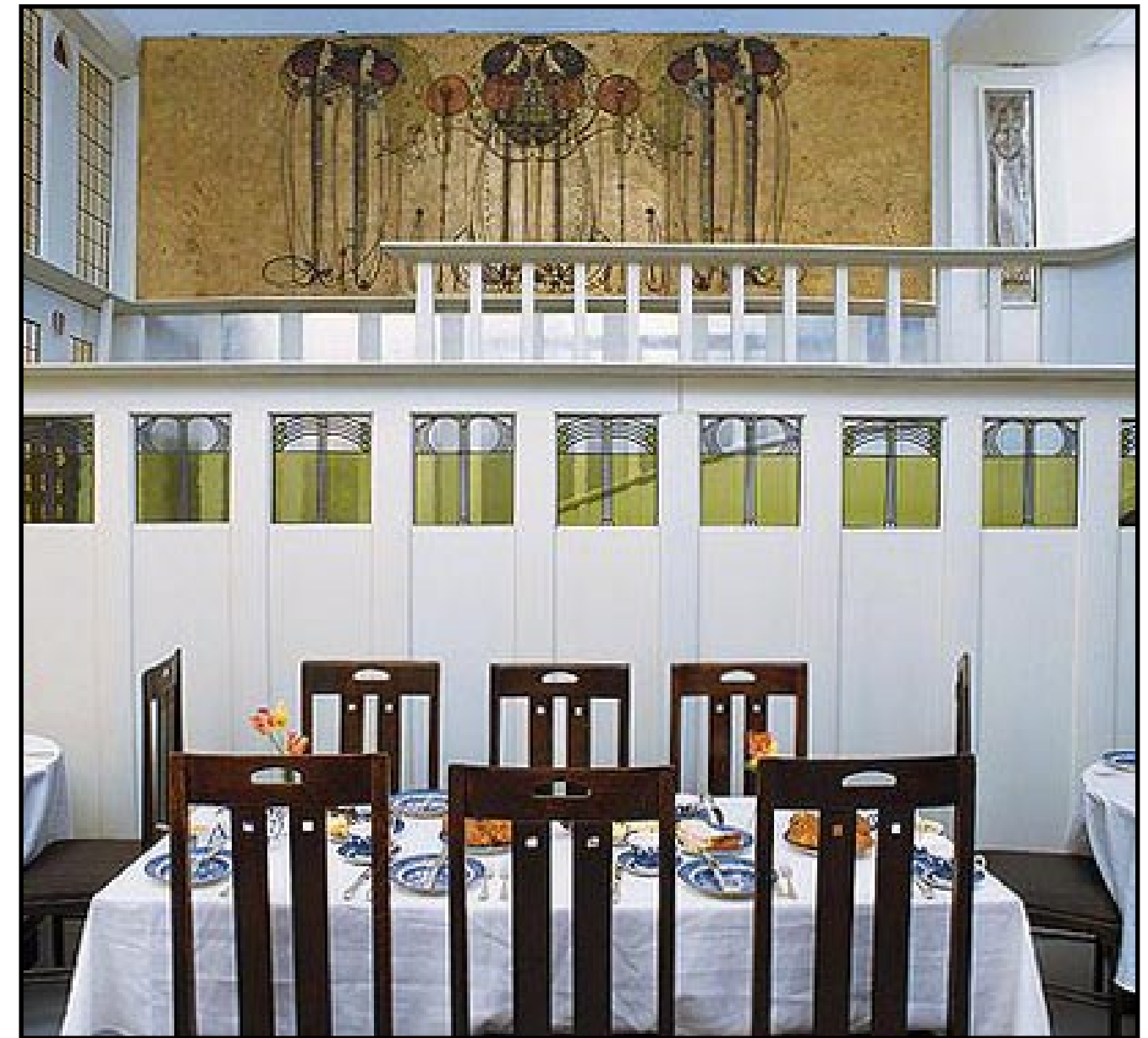
Tea Room, Charles Rennie Mackintosh, ca. 1910.

The design process involves working with 3-dimensional layout, color, light, furnishings, budget, site conditions, function and client preferences. As client and designer work through this matrix, they are involved in a process of spatial problem solving which has the potential to help us remember who we are, and to embed this radiant awareness into our spatial environments.