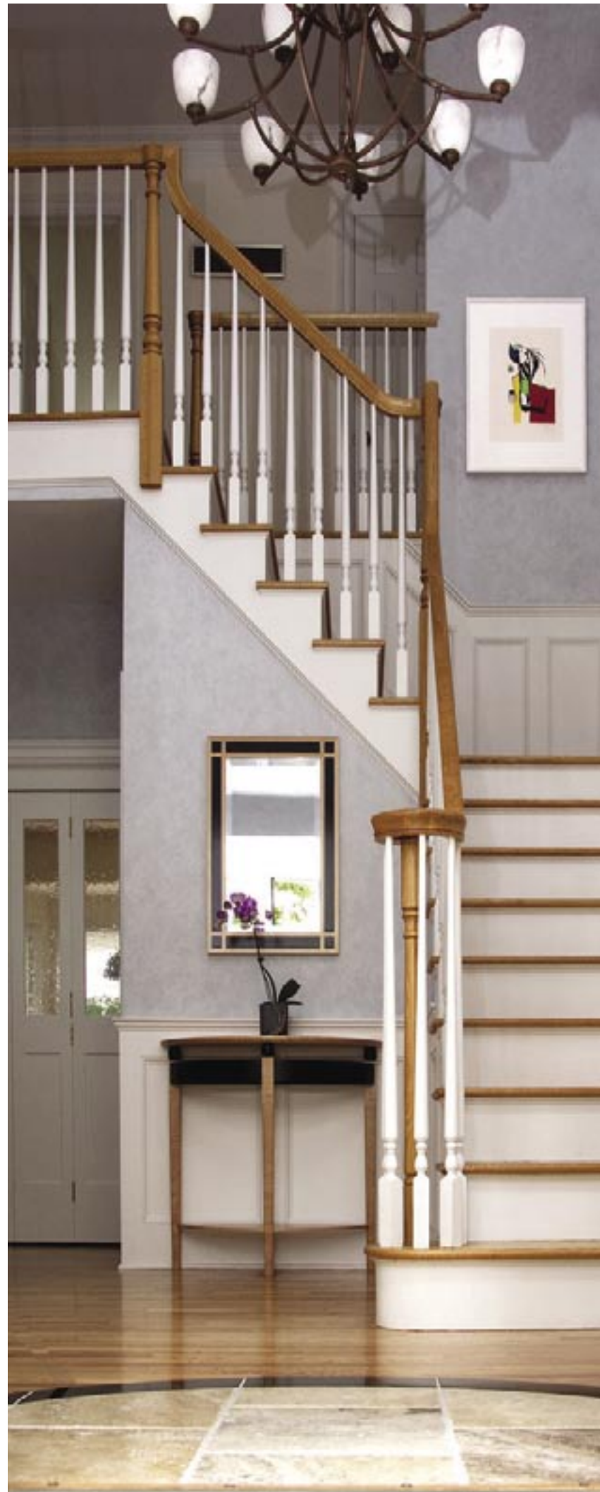
Entry, with existing stair, oak floor, chandelier and wainscote, Southbury, CT, Bloom Design LLC

The designer is obliged to engage the project with openness, providing a practiced creativity that responds to client needs and rejects rigidity. Working together in this way, designer and client can create environments that actively support day-to-day activities— spaces that are beautiful, functional and appropriate. These aspects of our environment were , in fact, never separate. The design process honors the needs of the whole project.