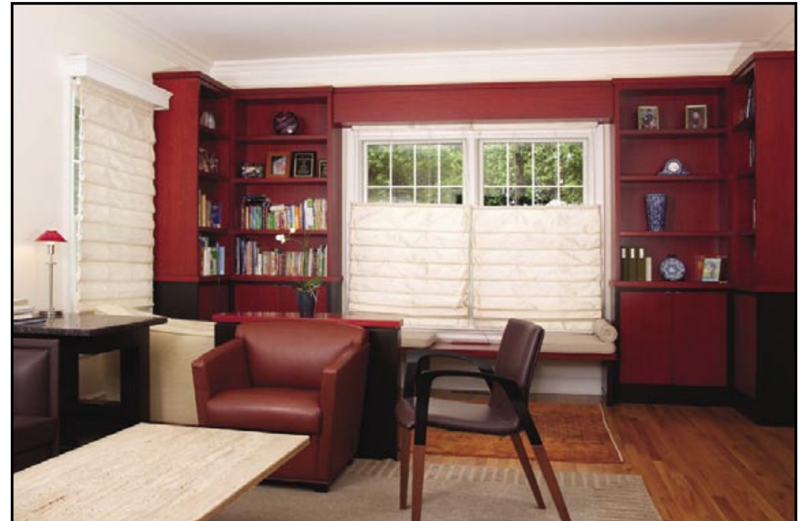
Home Study, Westport, CT, Bloom Design LLC