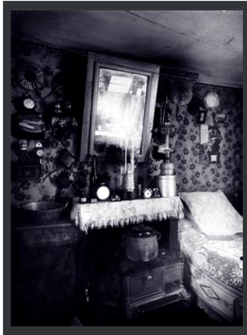
Eugene Atget, Interior with stove, bed and mirror, ca. 1910

We are at our best in beautiful, functional and appropriate spaces. In the absence of wilderness, well conceived interior space allows everything else to find its place.